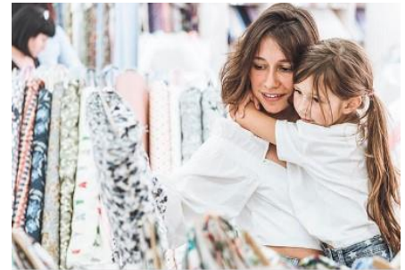
Sept 1-Oct 31 | All New England Shop Hop | Magazine | Prizes

https://allnewenglandshophop.com/shop-hop-basics/