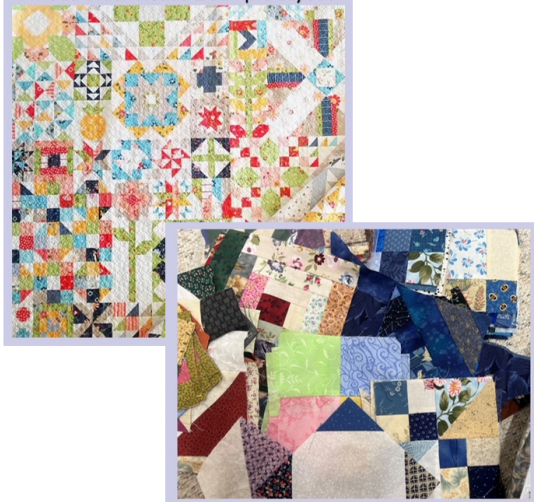
Moda Block Heads 2 Sample Layout

In this workshop, Missy, Blaire and Paula will provide guidance on how to take blocks that are different sizes, shapes, and colors and turn them into finished projects. These can be UFO projects that you want to reimagine such as orphan blocks from test patterns, project rejects, a collection of vintage blocks, a set of blocks won through a guild Block of the Month, or a t-shirt project. If you do not have a project, we will have orphan blocks donated to the guild for you to work with.